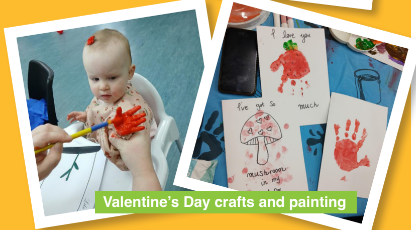
Valentine's Day crafts and painting