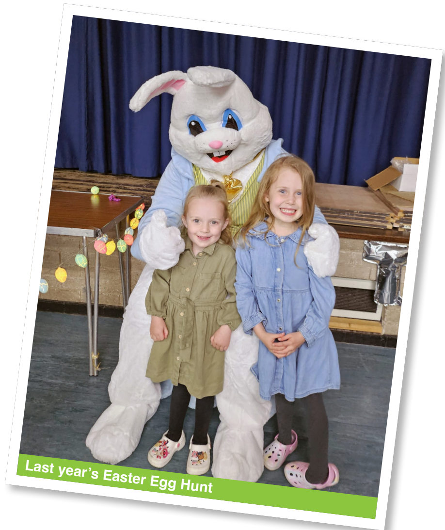
Last year's Easter Egg Hunt