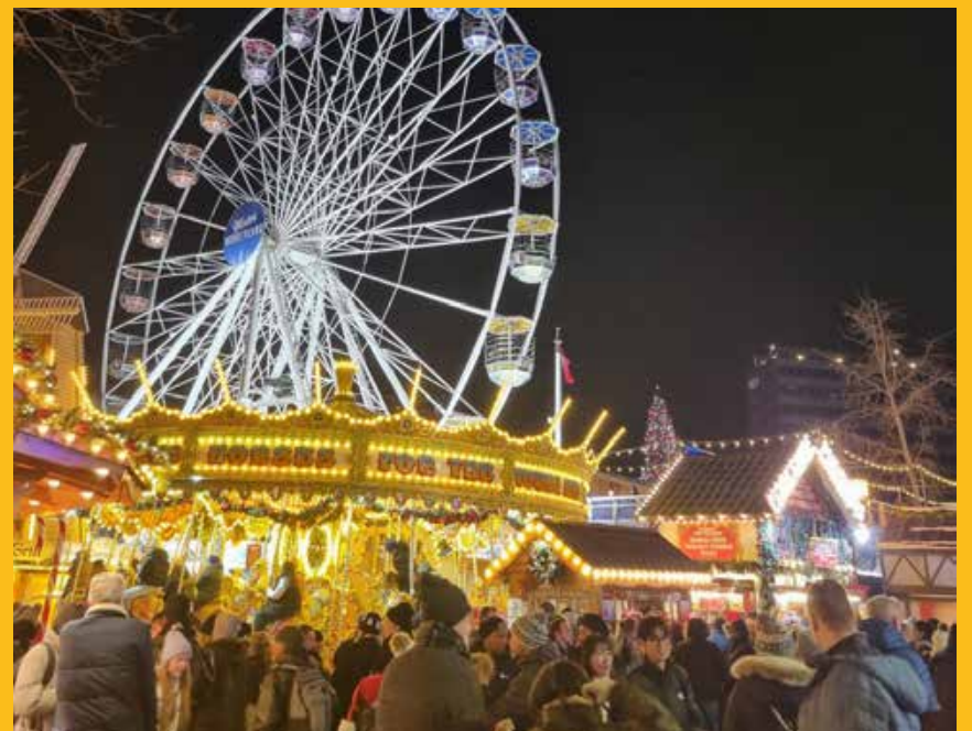
Nottingham's Christmas market

Later in the month, a coachload of 50 tenants and their friends enjoyed our day trip to Nottingham's Winter Wonderland and Christmas Markets – where a great time was had by all!