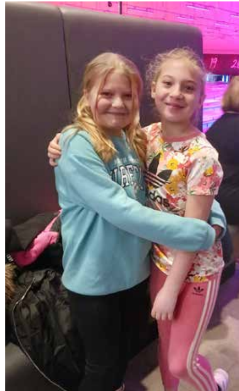
Friends wait their turn

"The children all had a fabulous time at the bowling alley, and were really pleased that their fundraising achievement was recognised with such a fun day out."