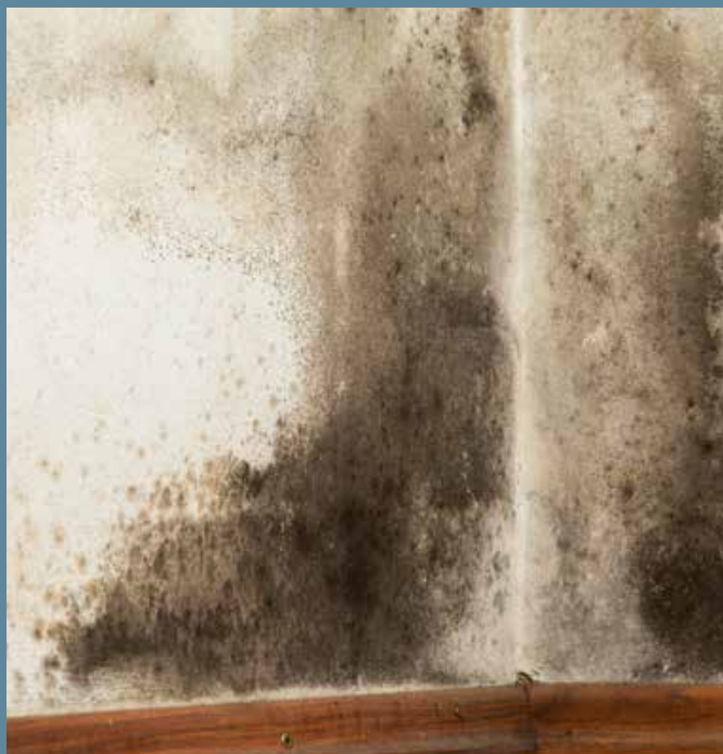
Not a Lyng property - this photo just shows how bad untreated mould can get

We will always do what we can to help. Here we have put together some useful advice to help prevent such issues becoming a problem.