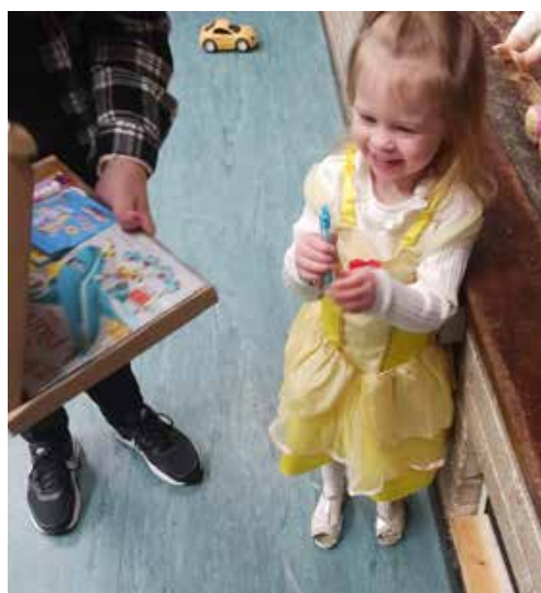
Winner of the Toddlers Group World Book Day competition picks up her prize